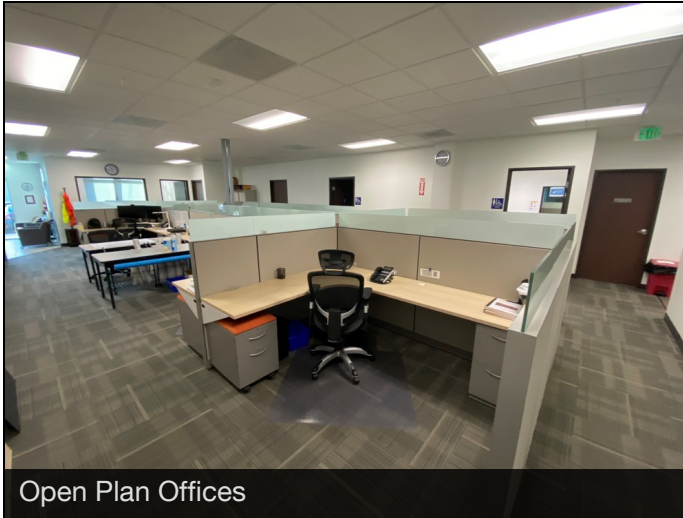
Open Plan Offices