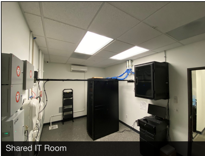
Shared IT Room