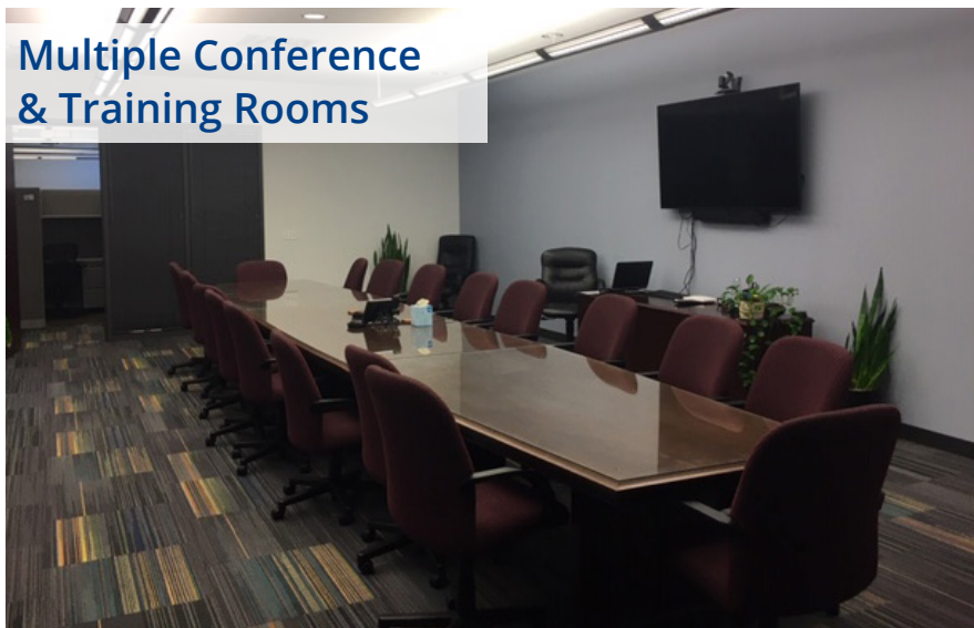
Multiple Conference & Training Rooms