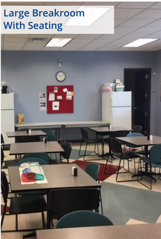
Large Breakroom With Seating