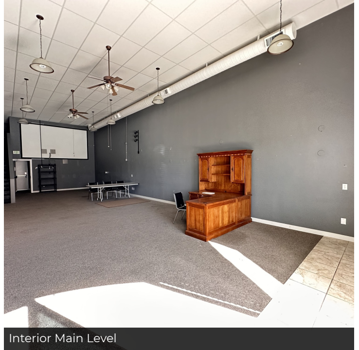
Interior Main Level