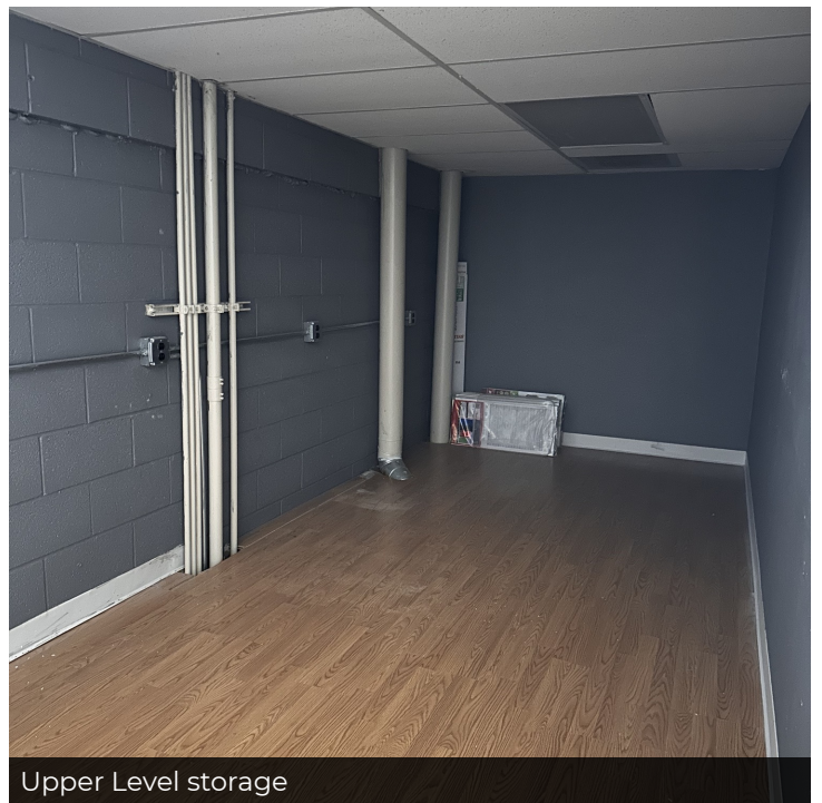
Upper Level storage