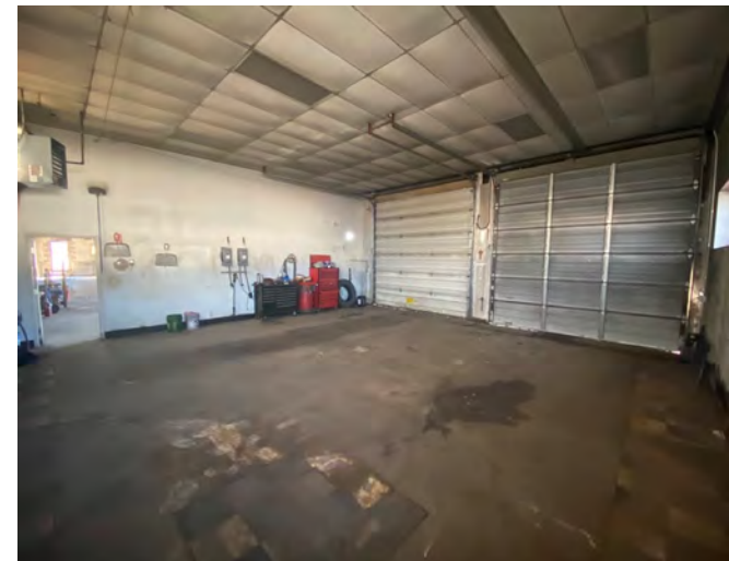
6,000 SF Building