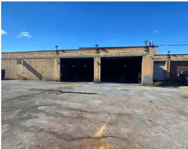
6,000 SF Building