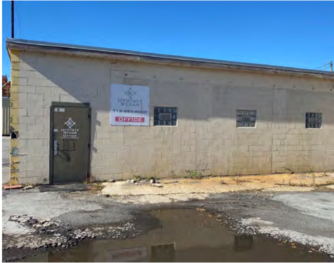
5,075 SF Building