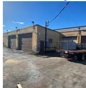
6,400 SF Building