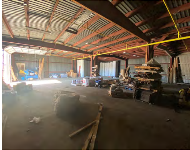
5,075 SF Building