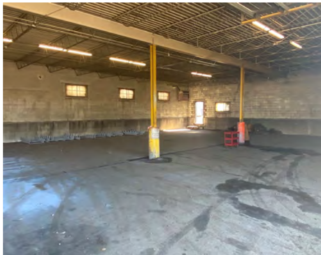
6,000 SF Building