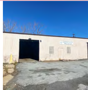
5,075 SF Building