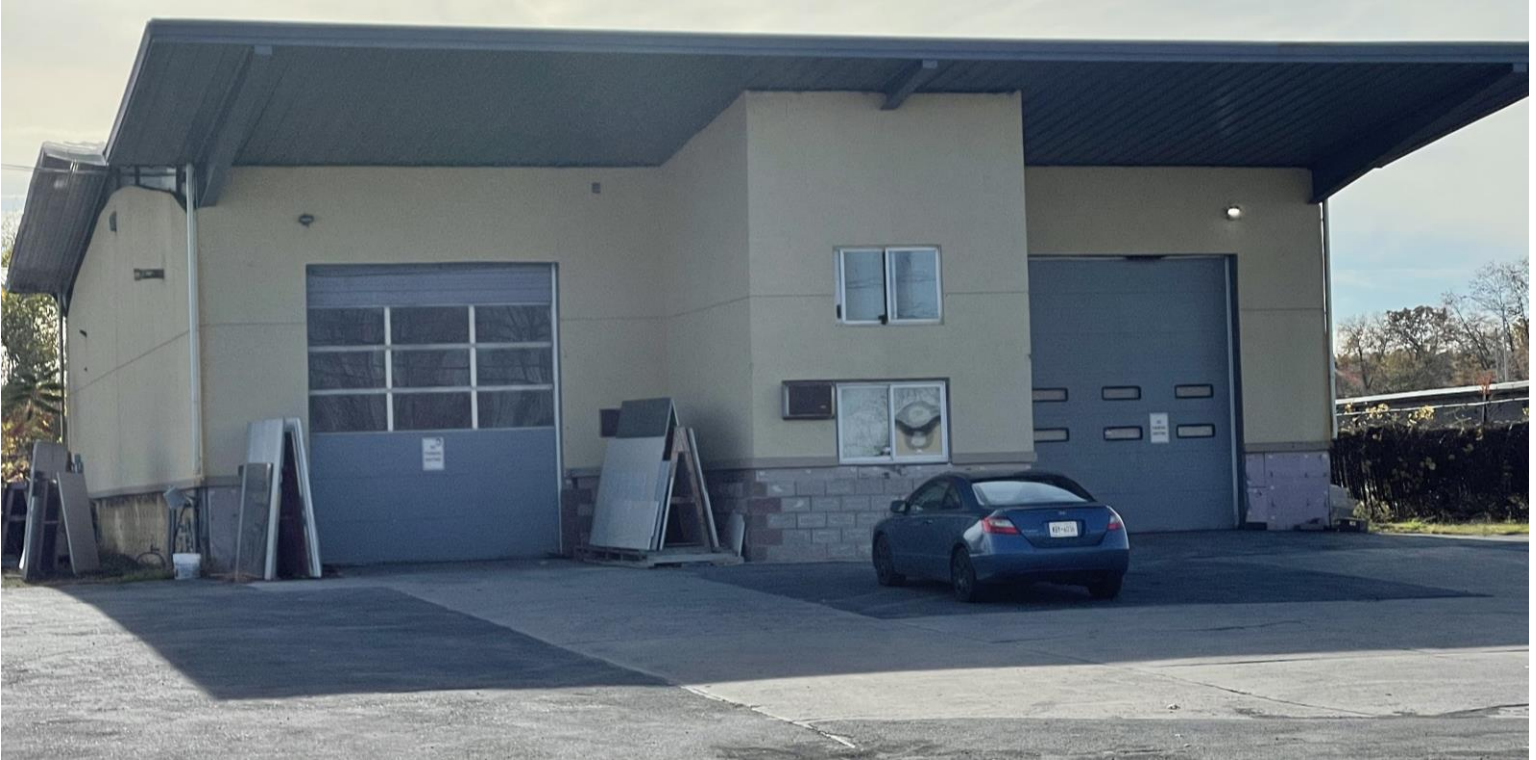
Two 14' overhead doors on front