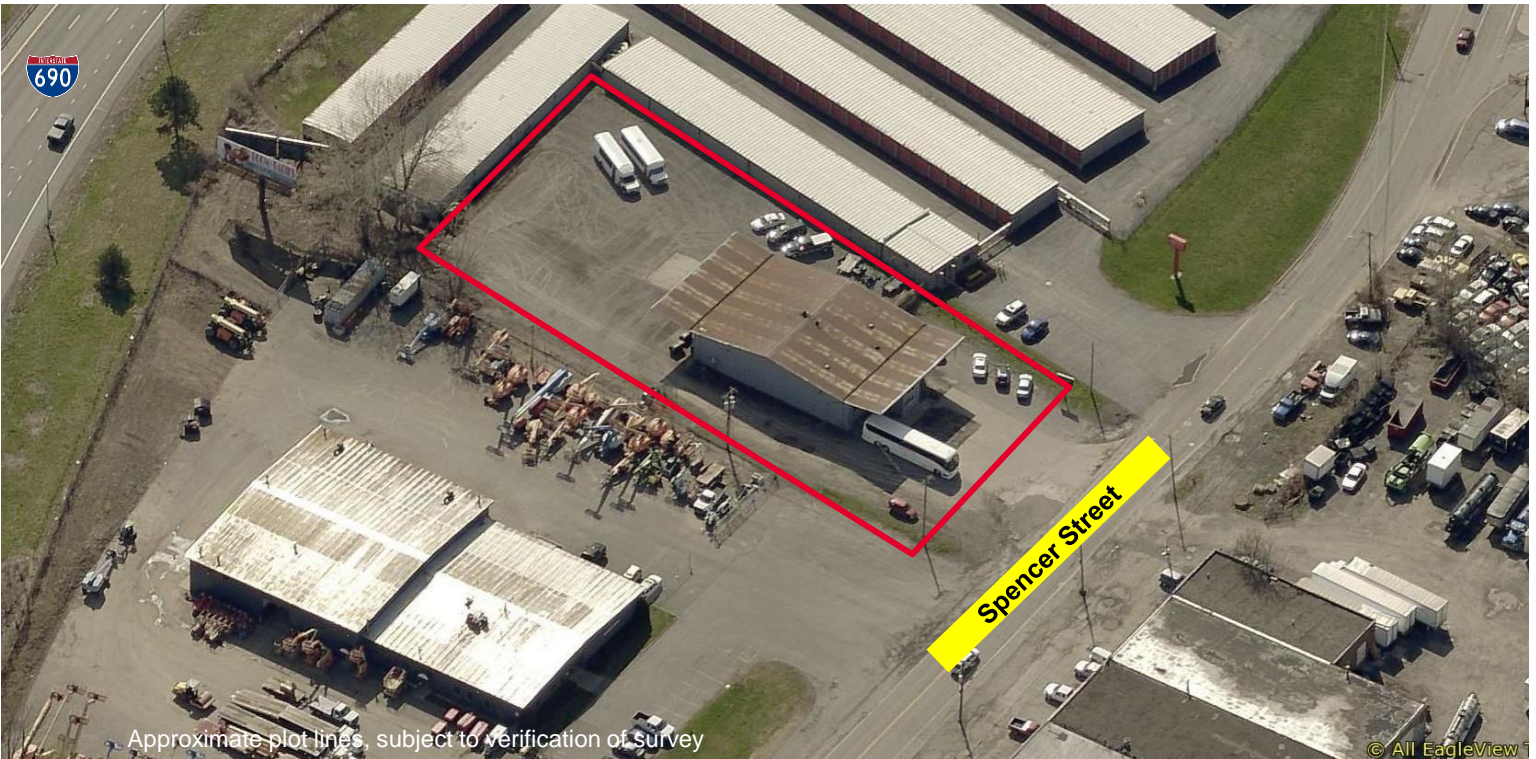
Approximate plot lines, subject to verification of survey