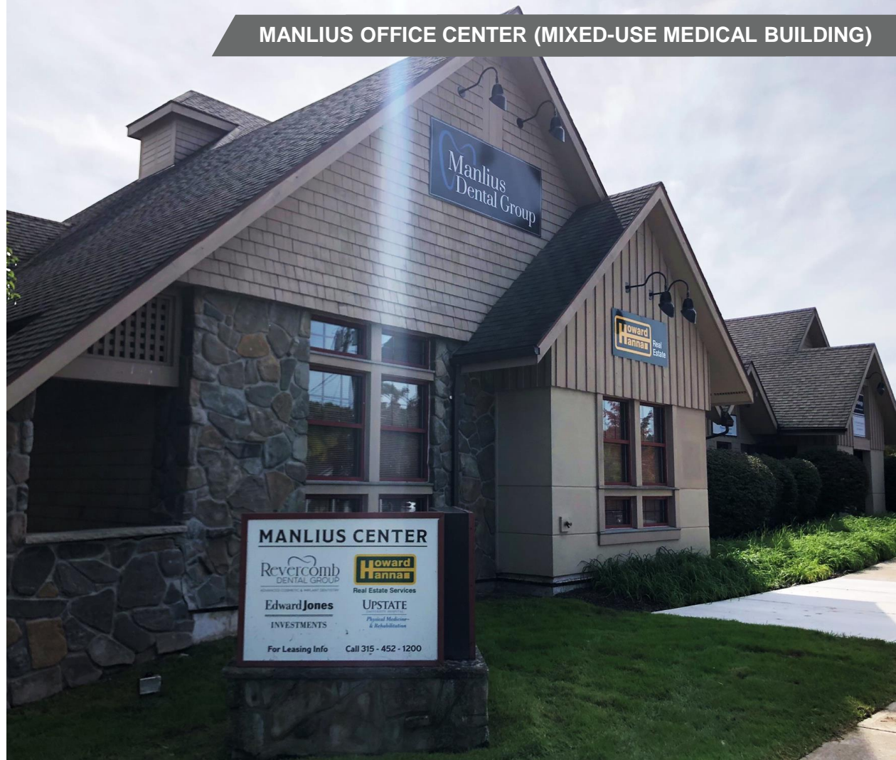
MANLIUS OFFICE CENTER (MIXED-USE MEDICAL BUILDING)