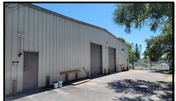
9292 - Building B