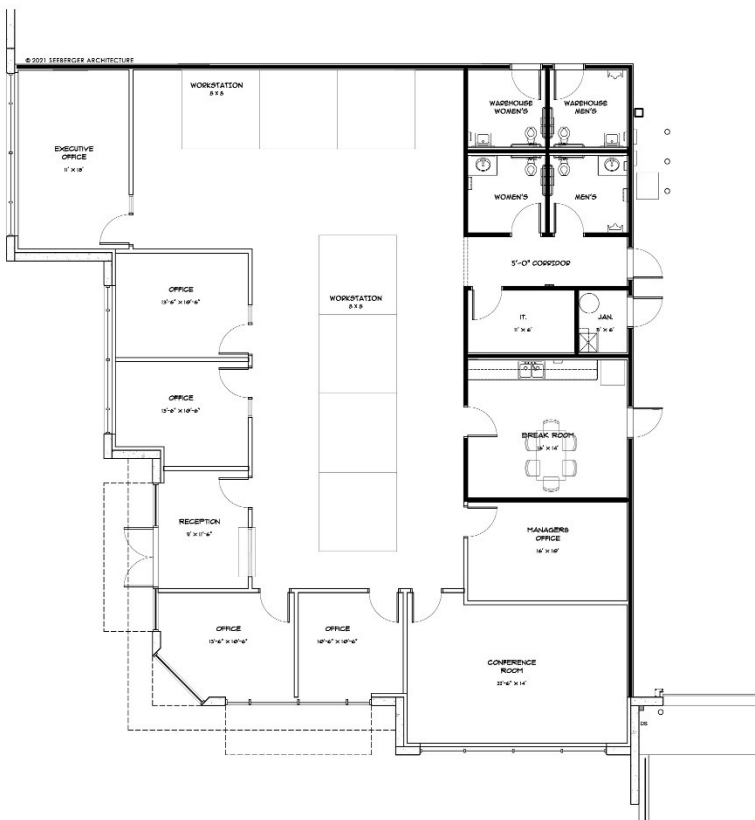
FUTURE OFFICE PLAN - ±3,574 S.F.

12020 Barker Cypress Road • Cypress, TX 77433