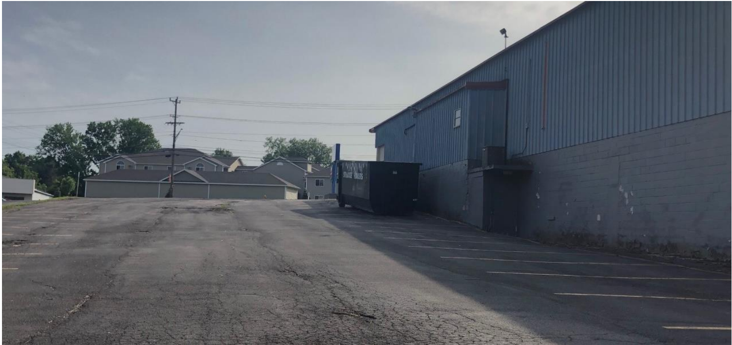
Northwest side of building