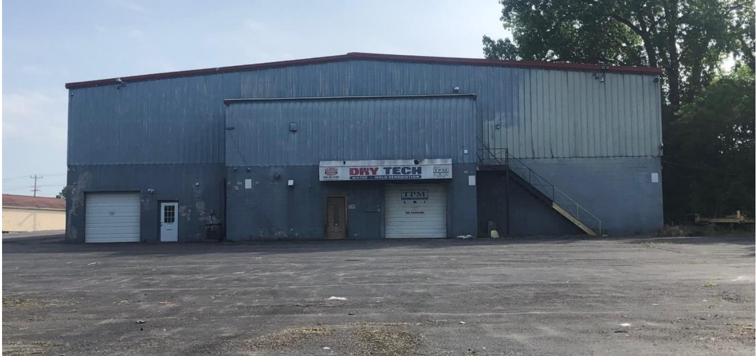
Rear of building