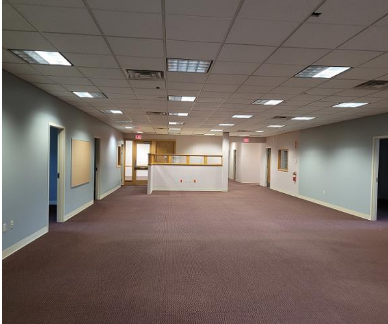
Open work area