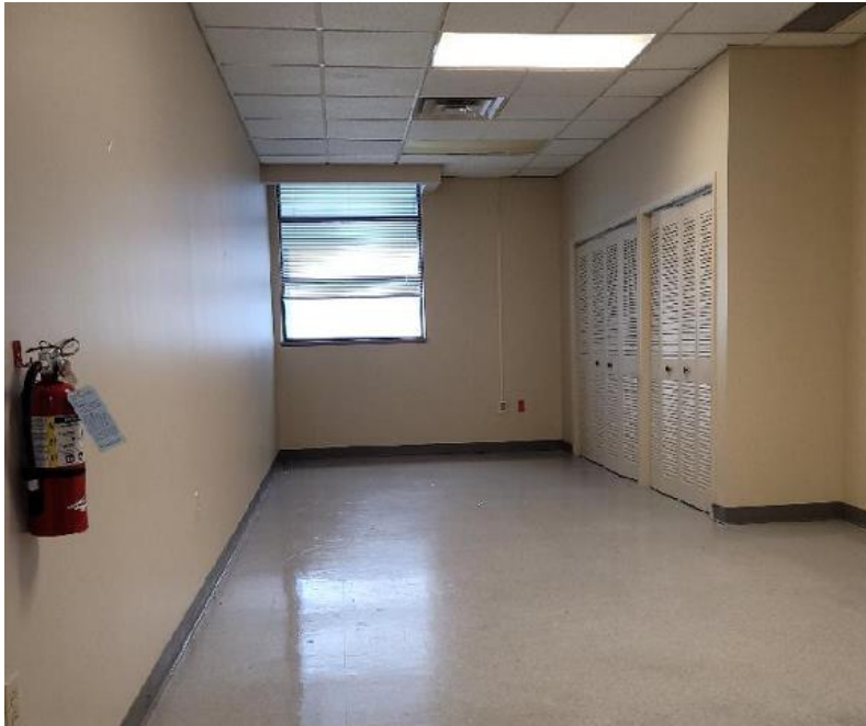
Supply and Storage Room