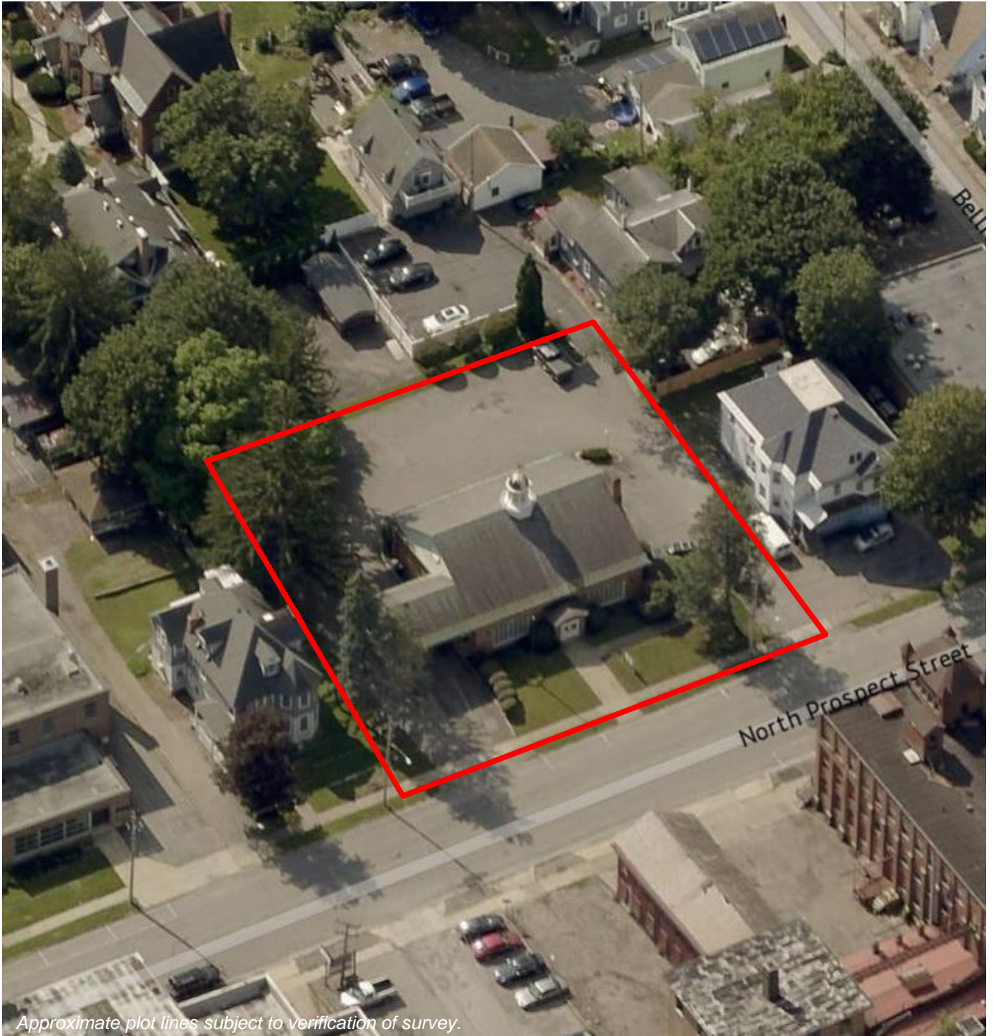
Approximate plot lines subject to verification of survey.