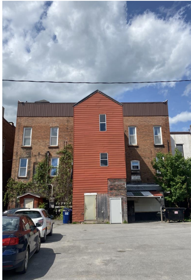
Ground Level Storefronts