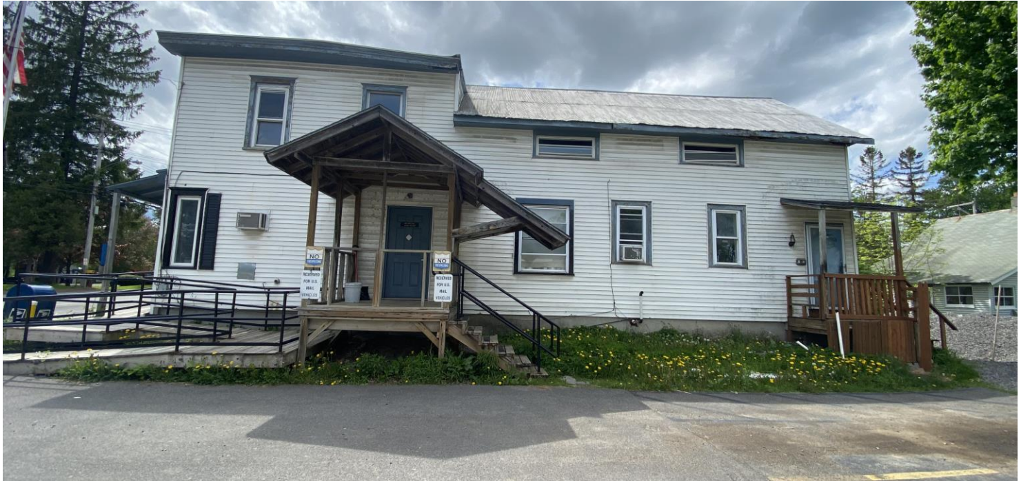
Exterior East Side