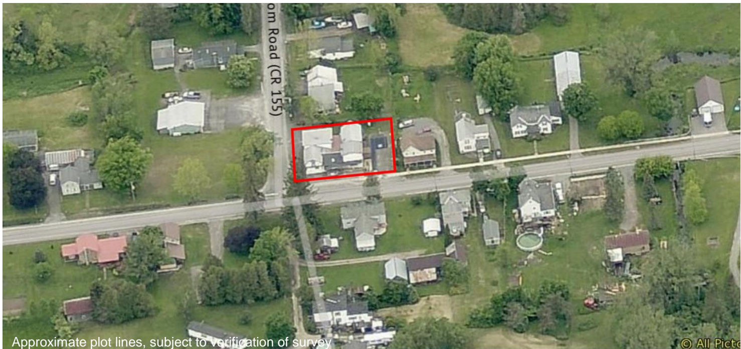
Approximate plot lines, subject to verification of survey