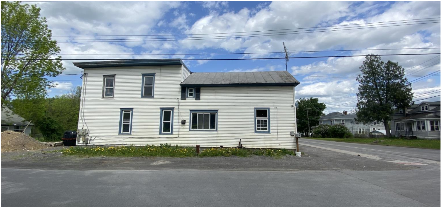
Exterior West Side