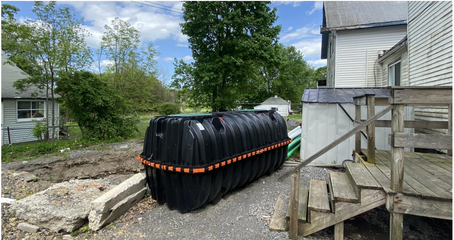
Septic, installed May 2022