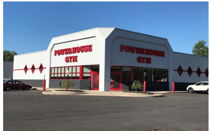
Freestanding building within shopping center