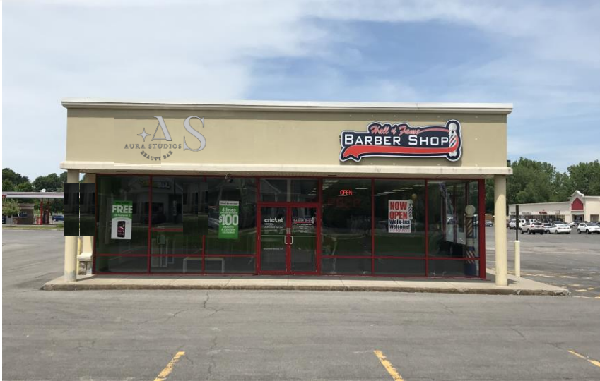
1,800± SF leased to Aura Studios