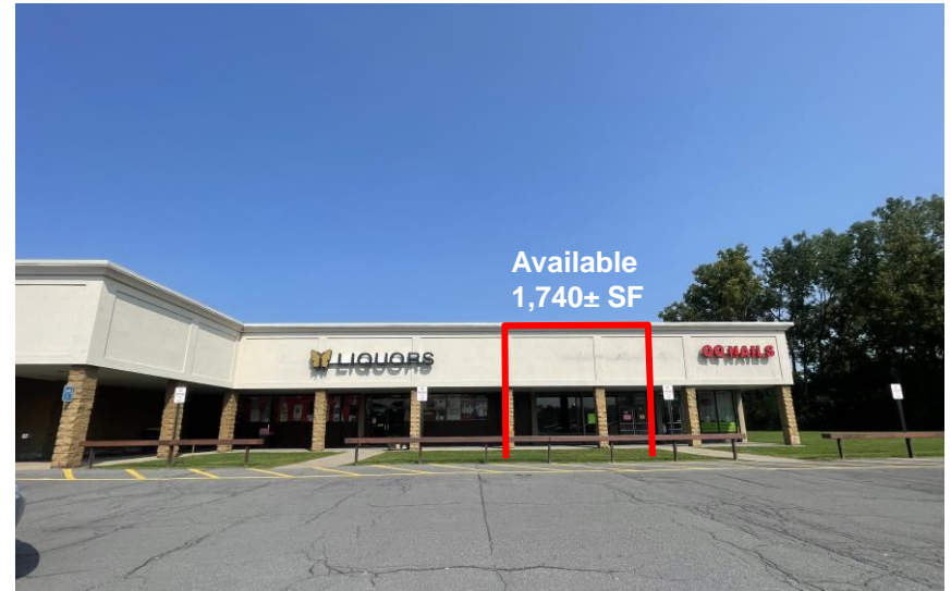
Space available next to Tops