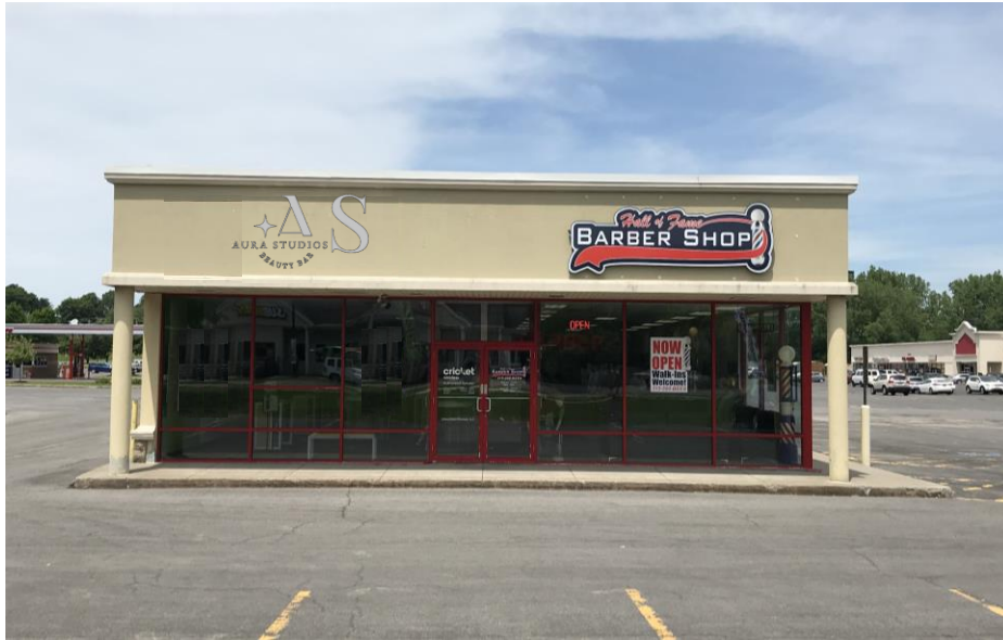
1,800± SF leased to Aura Studios