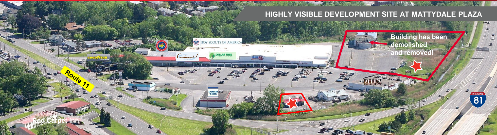
HIGHLY VISIBLE DEVELOPMENT SITE AT MATTYDALE PLAZA