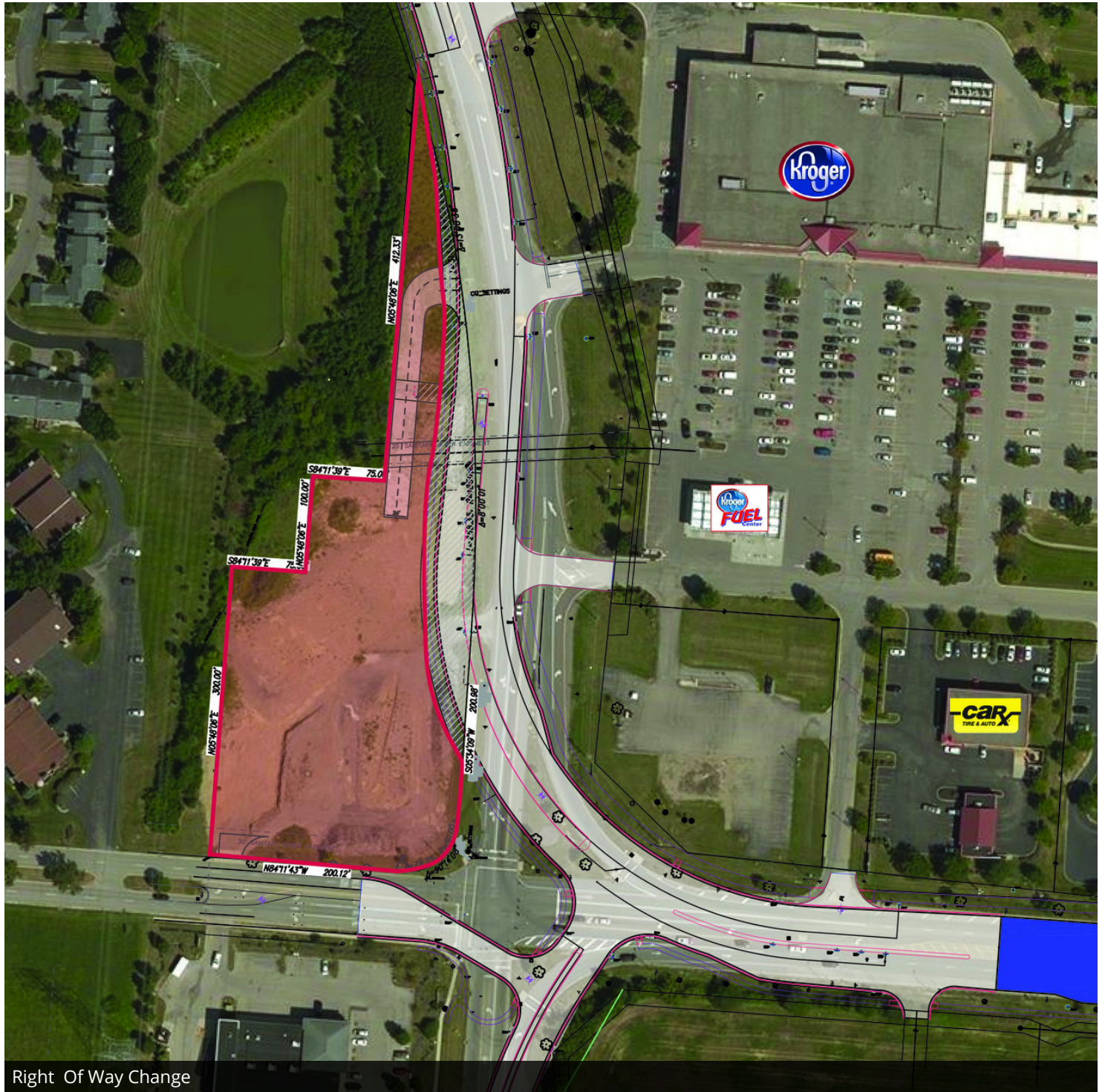
Right Of Way Change