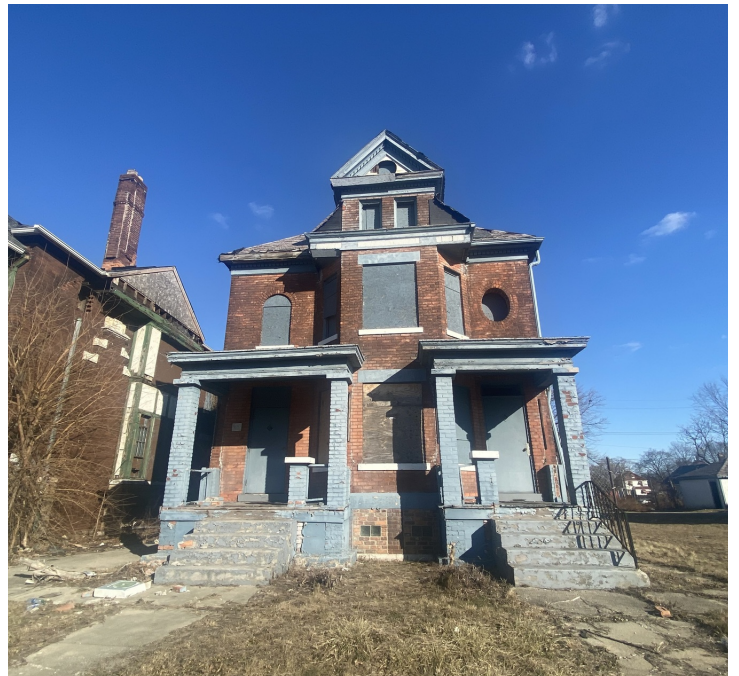
1104 E Grand Blvd