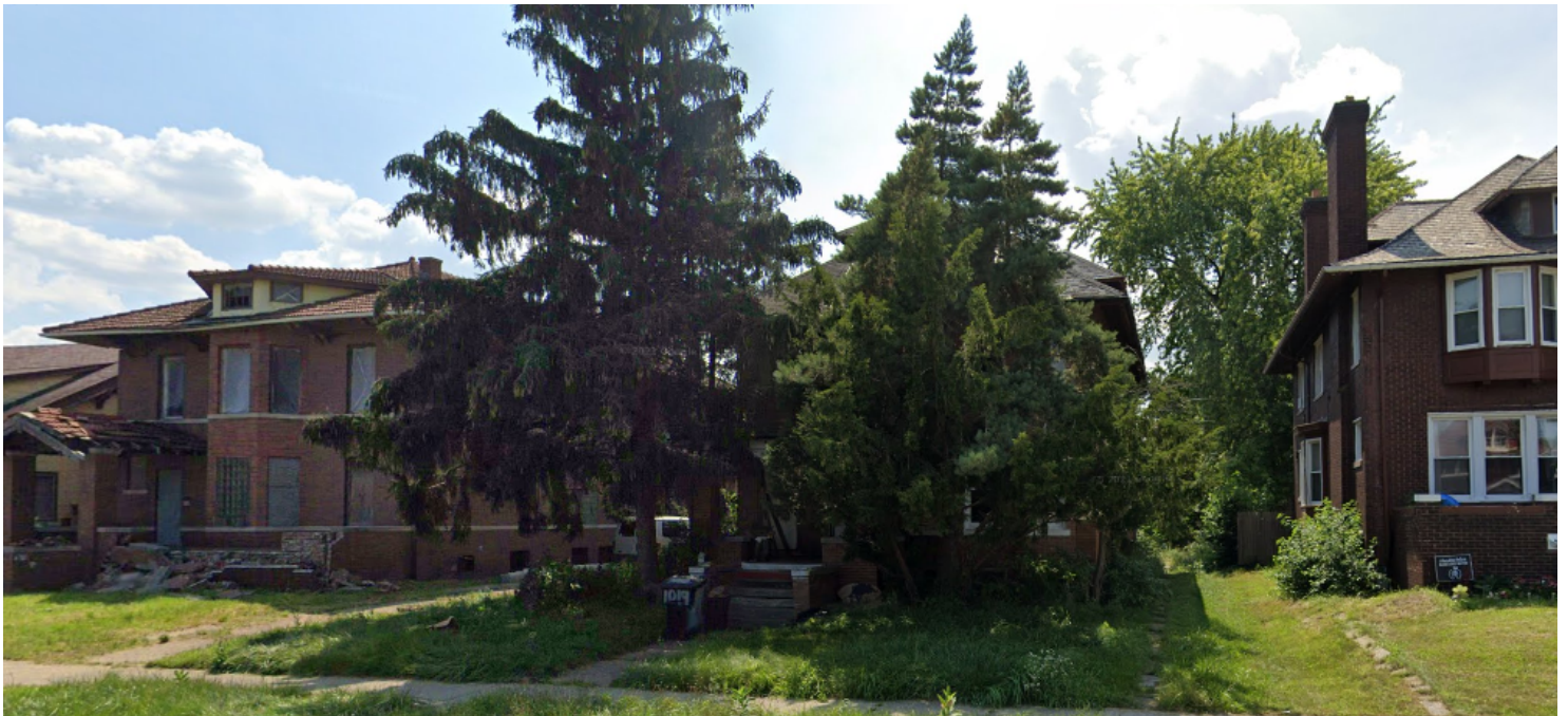
1017 E Grand Blvd