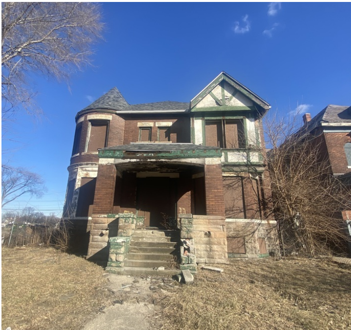
1110 - 1114 E Grand Blvd