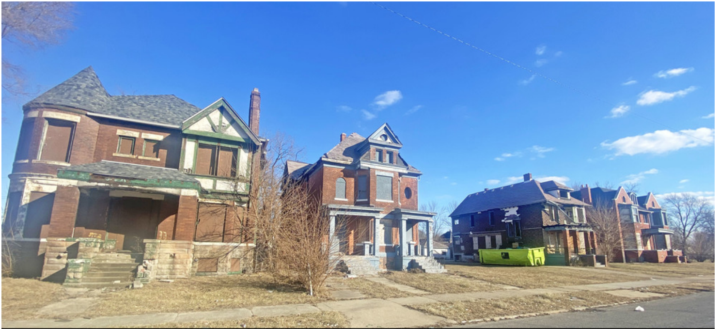
Overview of Three of the Multi-Family Properties