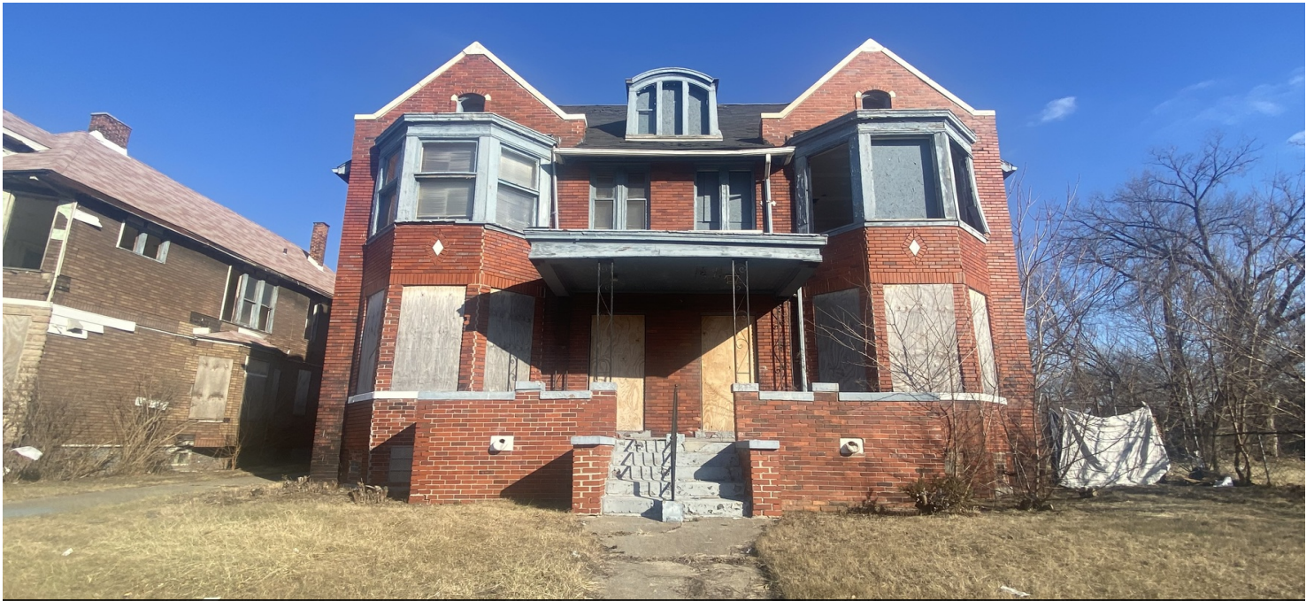
1092 - 1094 E Grand Blvd