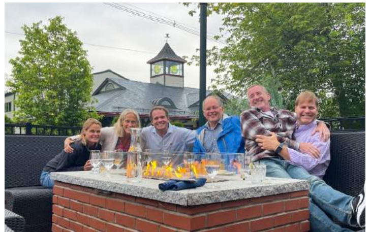
The Fire Pit is Connected by Natural Gas