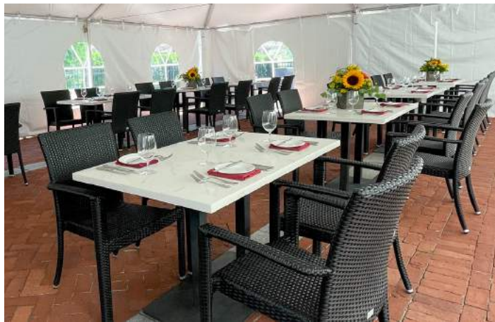
The Patio is Made of brick with a granite ribbon and water table detail. Tent is removable as are the sides.