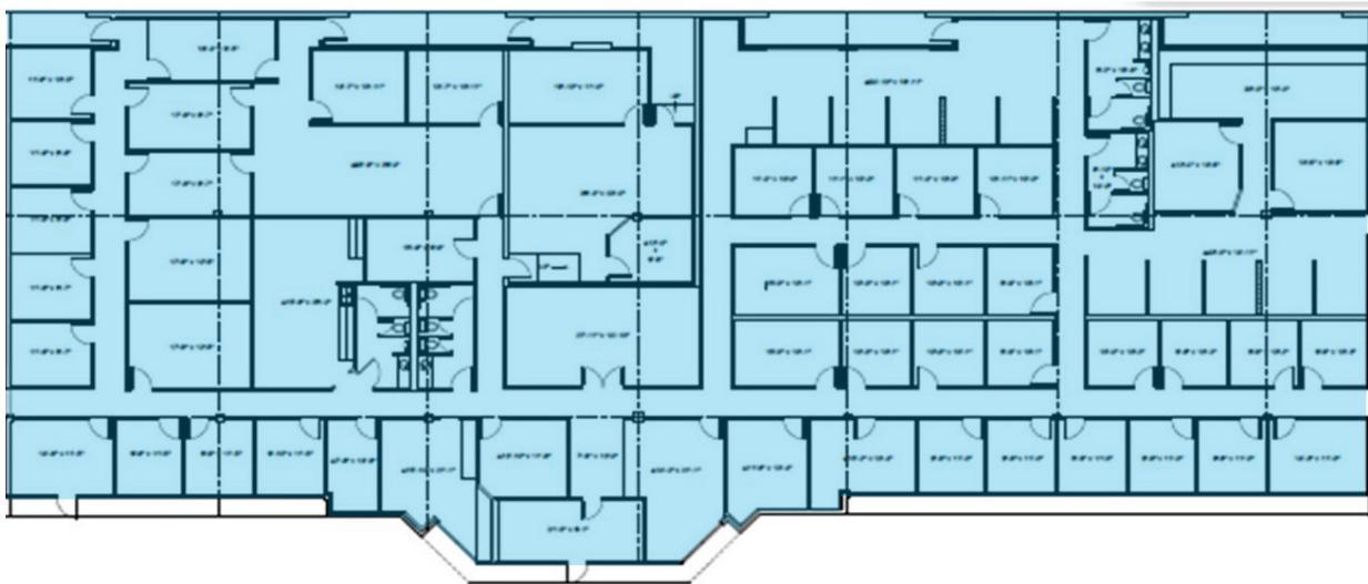
Suite 200/300 Current Floor Plan