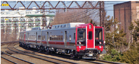
DIRECT ACCESS TO PORT CHESTER METRO NORTH STATION