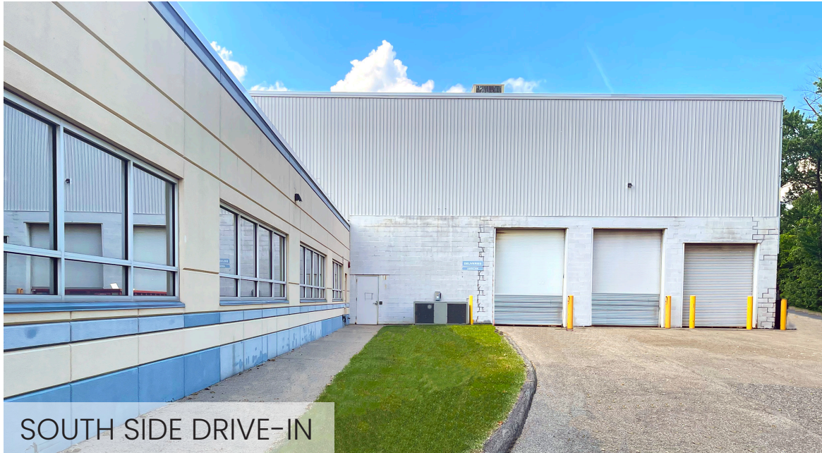
SOUTH SIDE DRIVE-IN