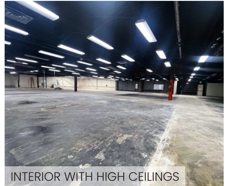
INTERIOR WITH HIGH CEILINGS

RM FRIEDLAND COMMERCIAL REAL ESTATE SERVICES