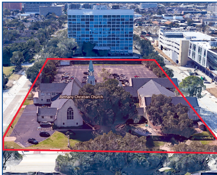
Westheimer view of property