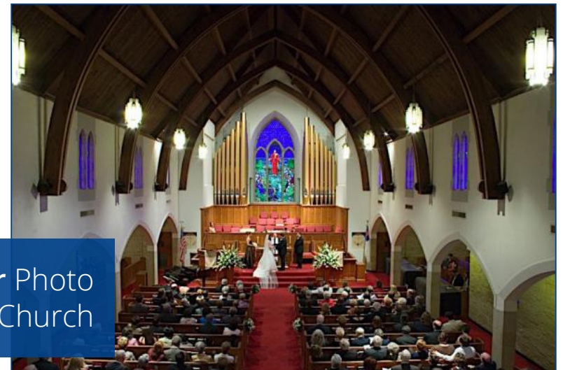
Interior Photo of Church