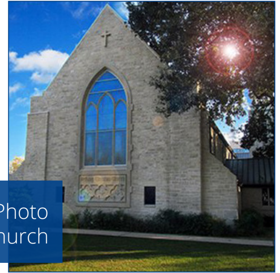
Exterior Photo of Church