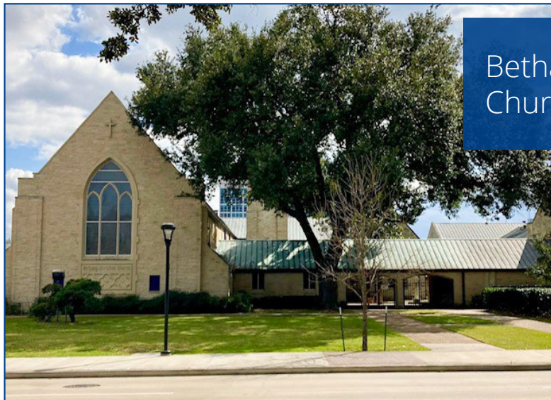
Bethany Christian Church in 2022