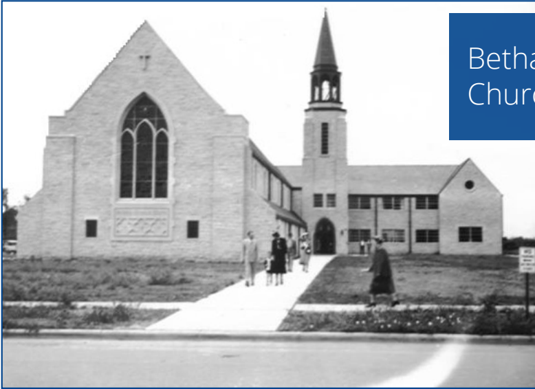
Bethany Christian Church in 1947