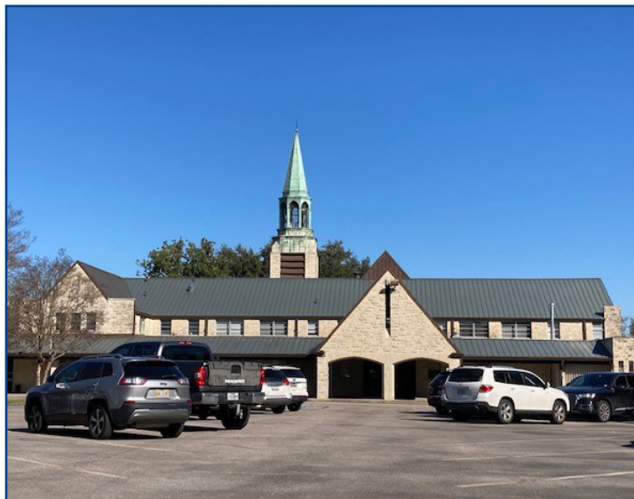
View from main entrance on Bammel Lane

Colliers exclusively represents Bethany Christian Church in the sale of the 3.243 acres and improvements at 3223 Westheimer Road. Bethany Christian Church was originally built in 1947 with additional improvements added over the years. The property has street frontage on three sides including Westheimer Road, Bammel Lane, and Eastside Street.