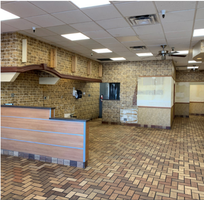
2nd Gen Restaurant - 1,181 SF