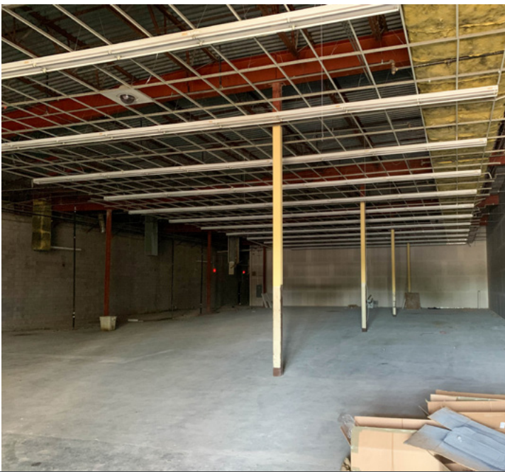
Junior Anchor - 11,975 SF