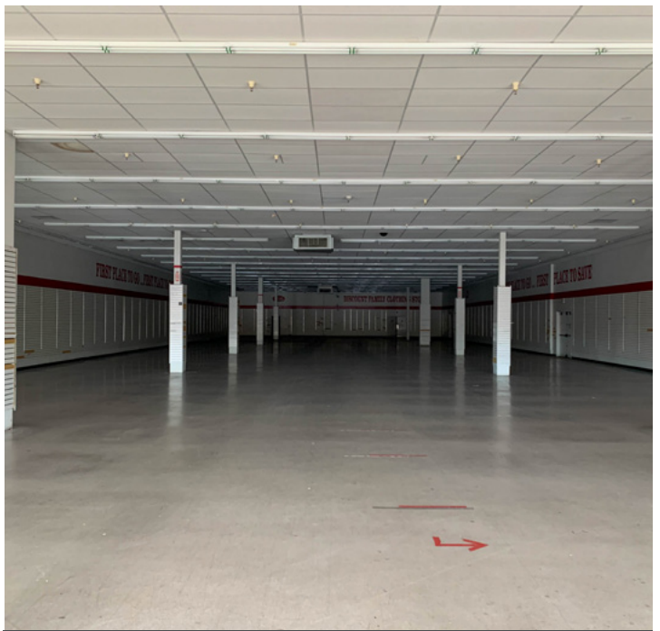
Anchor Space - 19,524 SF