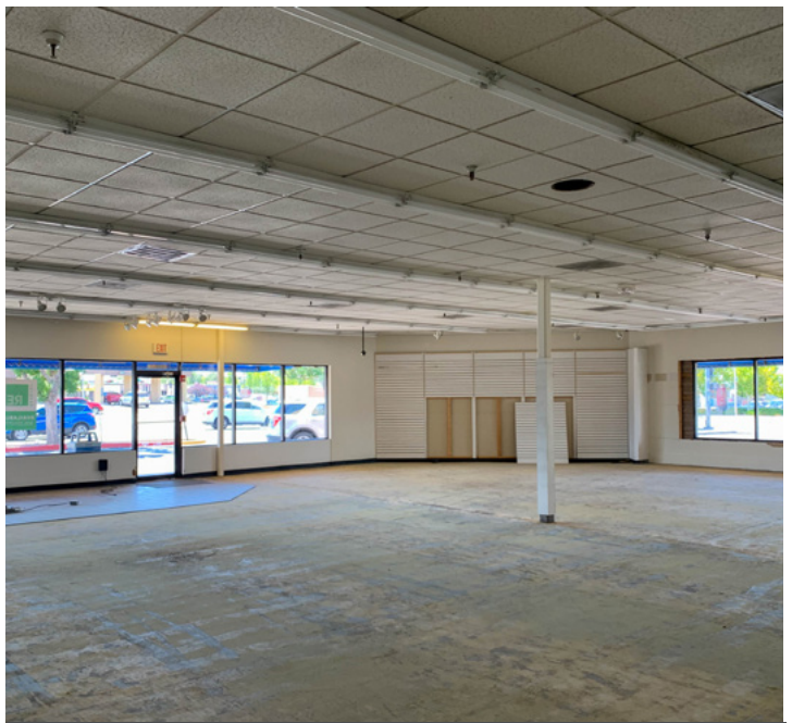
End Cap - 3,262 SF

Daniel Kearney dkearney@resolutre.com 505.337.0777