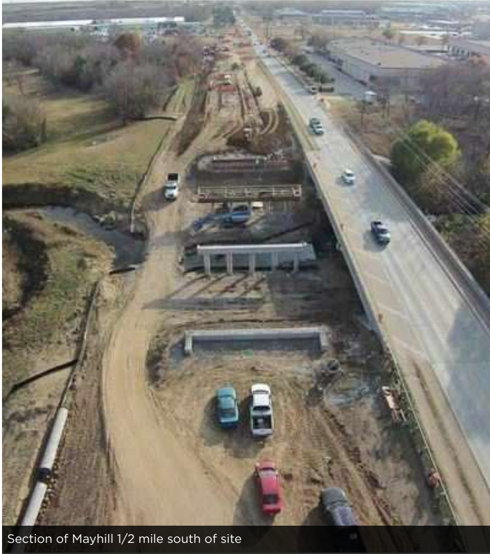
Section of Mayhill 1/2 mile south of site