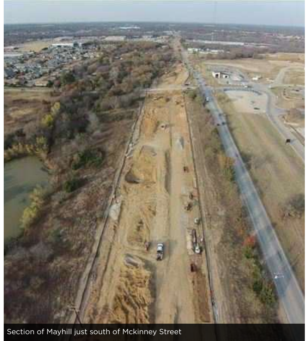
Section of Mayhill just south of McKinney Street