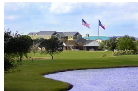
Zaharias Golf Course

"Residents will enjoy the peaceful lifestyle of a small community, with the cultural, social, and economic advantages of a city many times its size. Nederland, Texas is the perfect place to do business or raise a family."