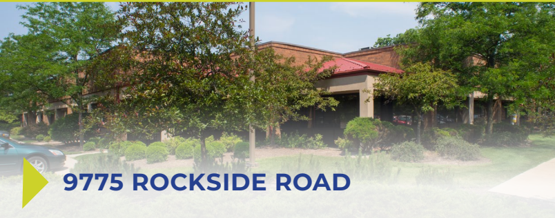
9775 ROCKSIDE ROAD