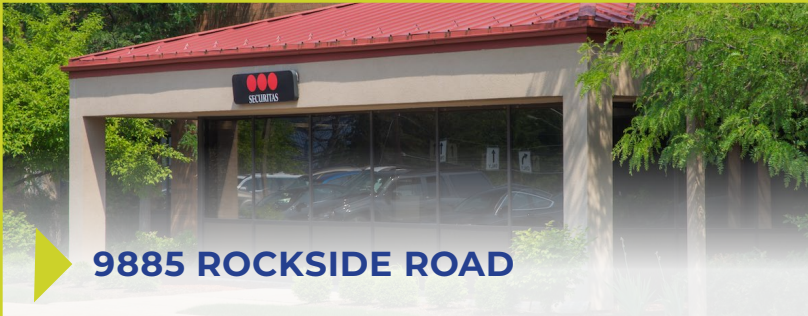
9885 ROCKSIDE ROAD