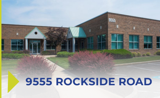
9555 ROCKSIDE ROAD