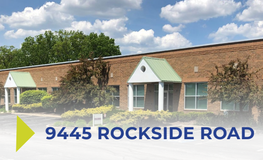
9445 ROCKSIDE ROAD