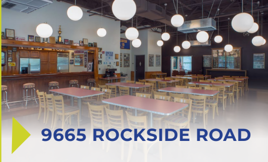
9665 ROCKSIDE ROAD