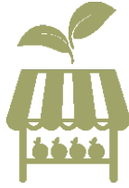
The Vibe grab-n-go market