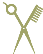
Onsite hair salon