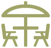
Indoor and outdoor patio seating