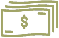
Onsite Chase Bank branch