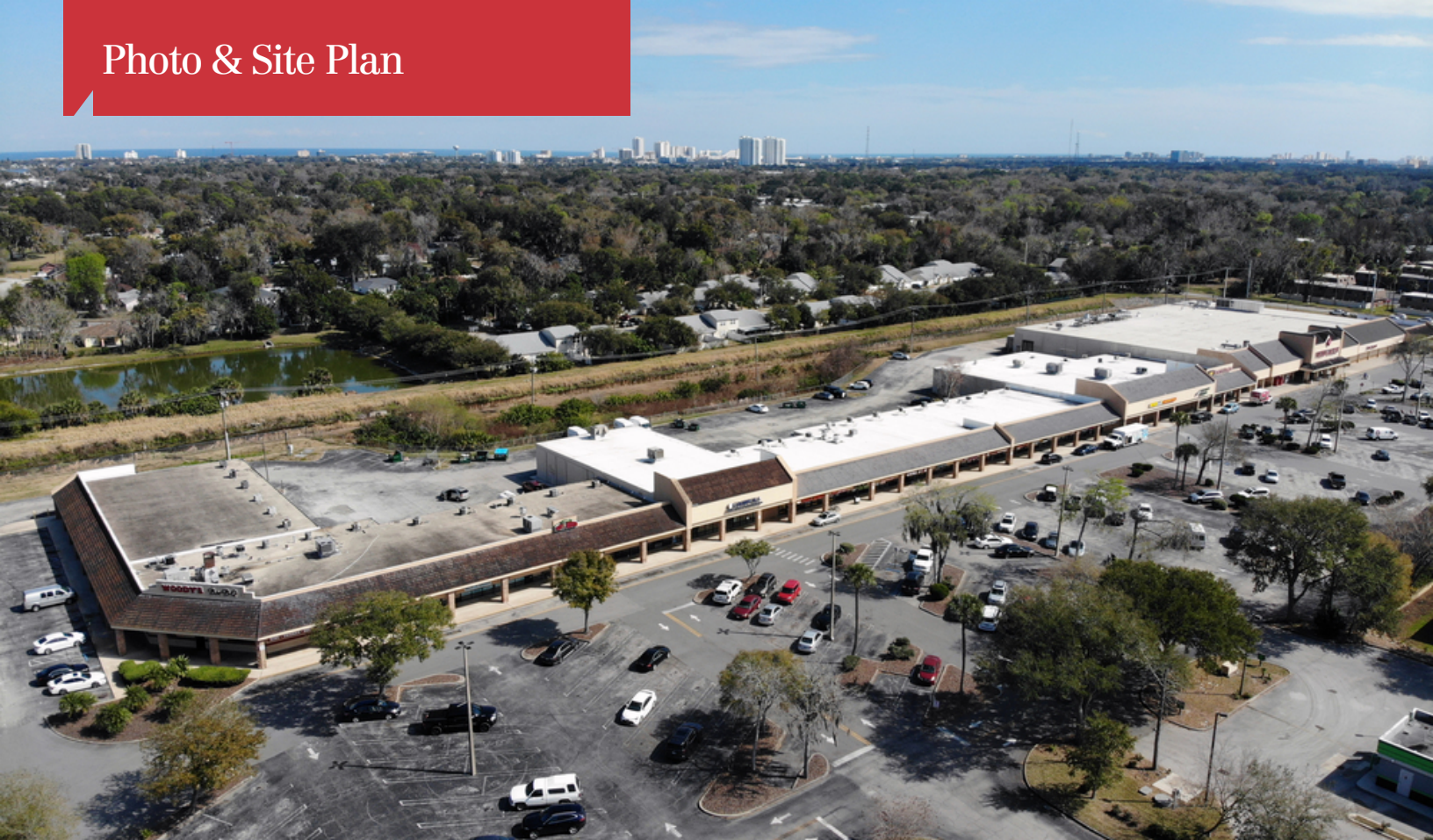
Photo & Site Plan