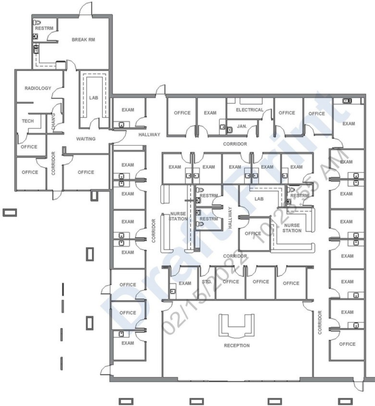
1 Existing Floor Plan 1/8" = 1'-0"