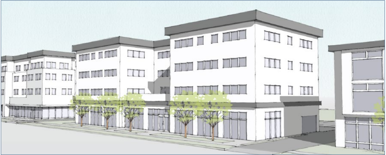
Figure 23: Illustrative Scale and Character

The MC district is intended to accommodate medium-scaled developments with a mix of storefront retail, professional office, and/or residential dwelling units along arterial and collector corridors at a scale larger than the neighborhood-scale uses accommodated by the MN zoning district.