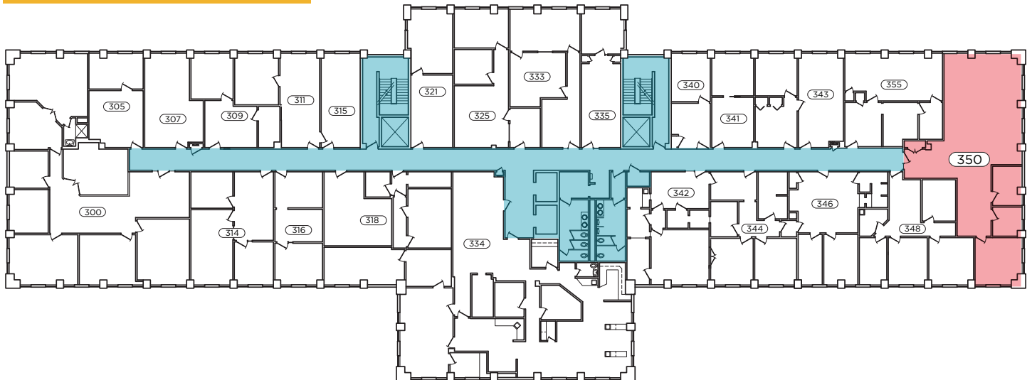
TERRACE PLAZA - THIRD FLOOR PLAN