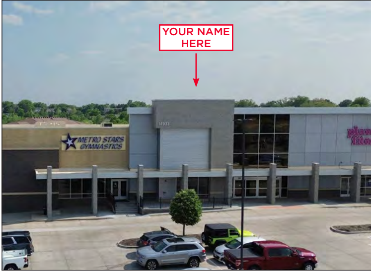
14929 Evans Plaza 13,300 SF