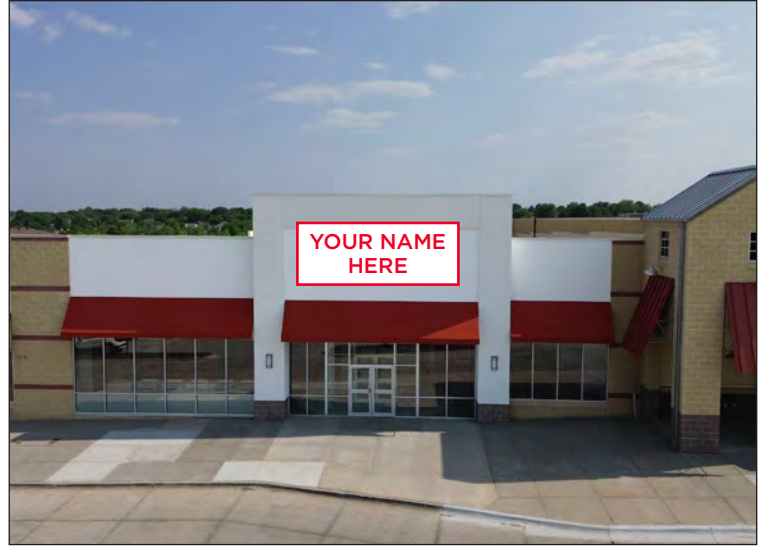
14945 Evans Plaza 10,003 SF