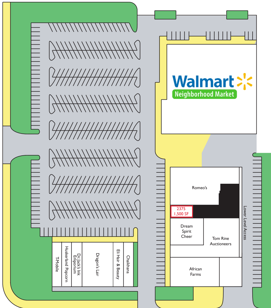
Drawing not to scale