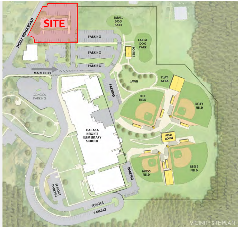
VICINITY SITE PLAN