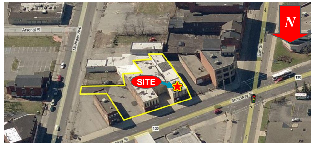
Tax Map / Aerial