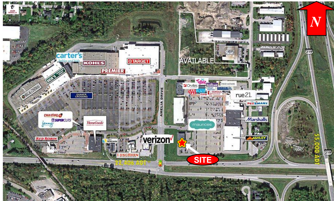
Plaza Aerial + Co-Tenants