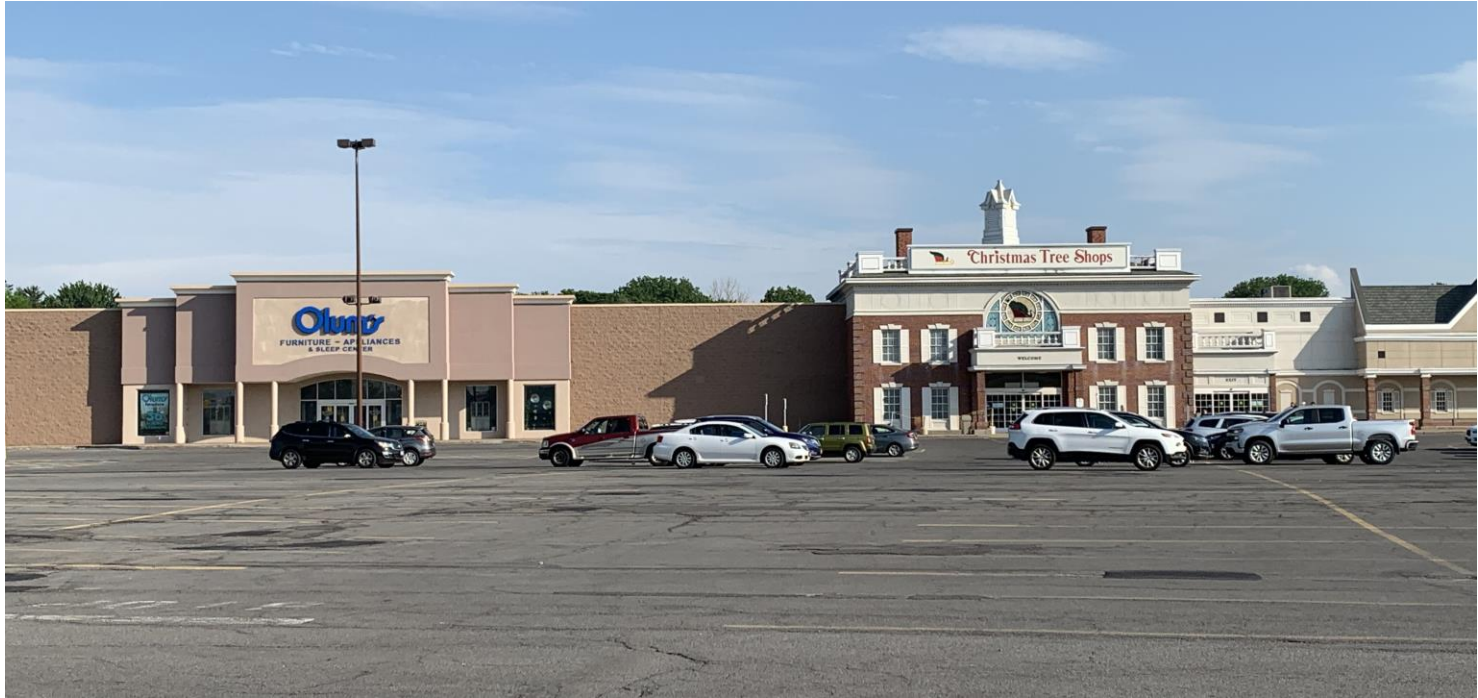
Co-tenant with Olum's and Christmas Tree Shops