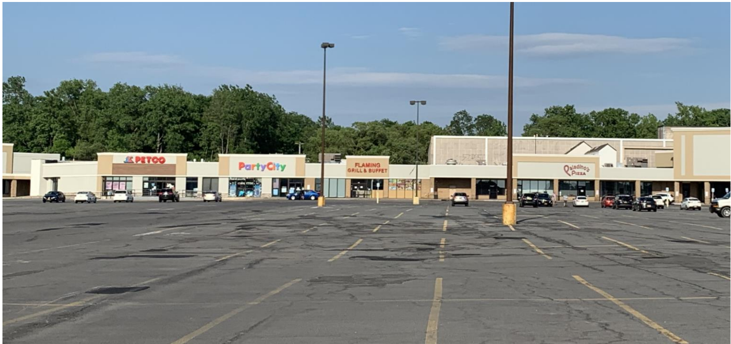
Additional Co-Tenants include Petco, Party City, Flaming Grill and Paladino's Pizza