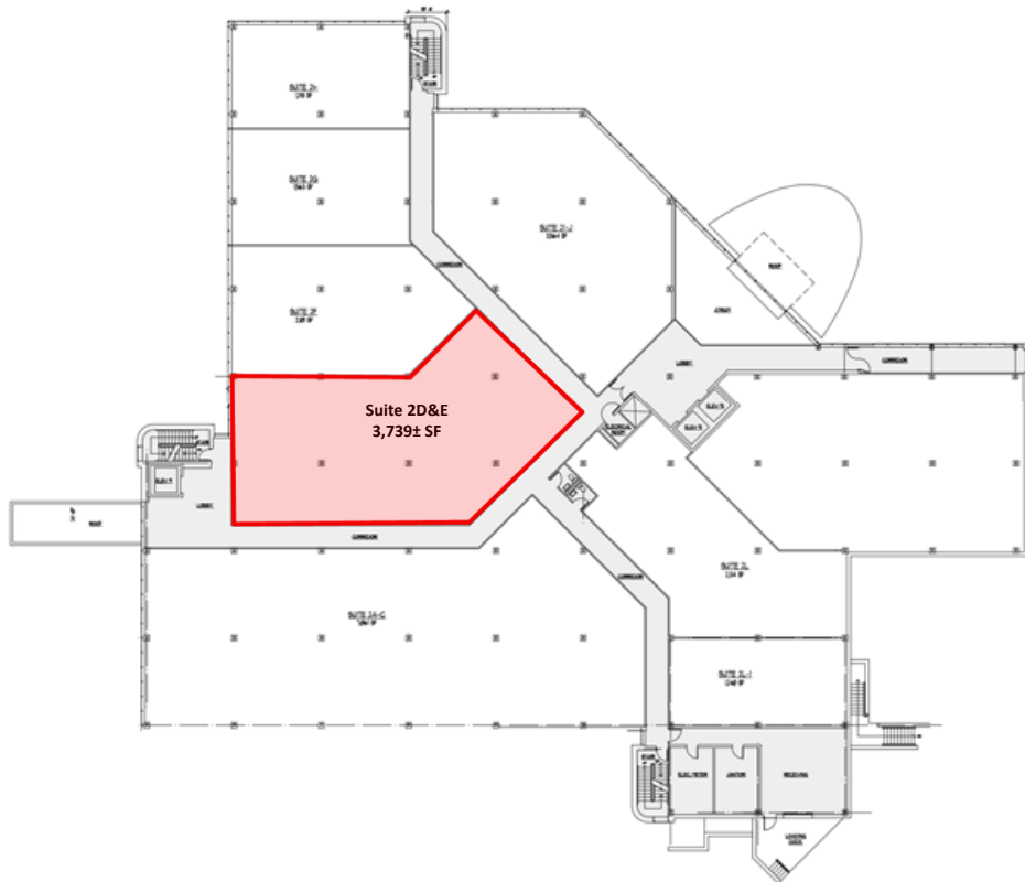
Second Floor Layout