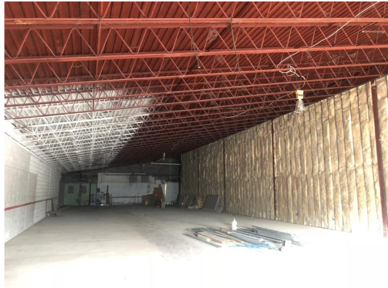
UNIMPROVED 4,473± SF SPACE