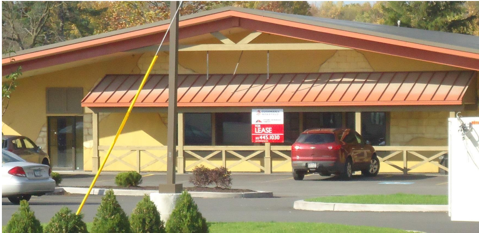
VIEW FROM ROUTE 31