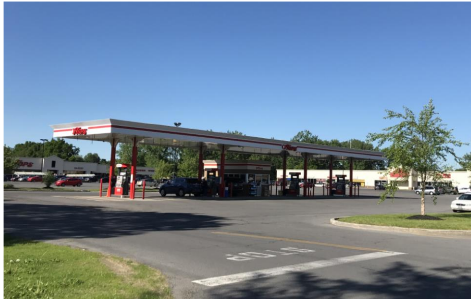
Tops Gas Pumps