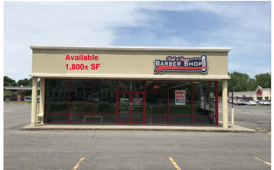
Outparcel facing Downer Street – 1,800± SF Available