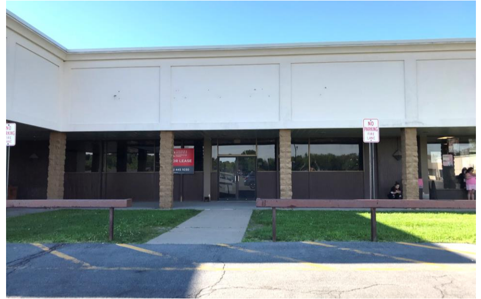
Space Available next to Tops