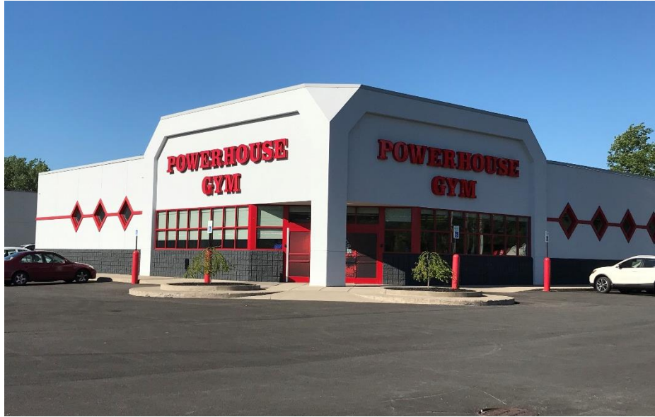
Freestanding building within shopping center