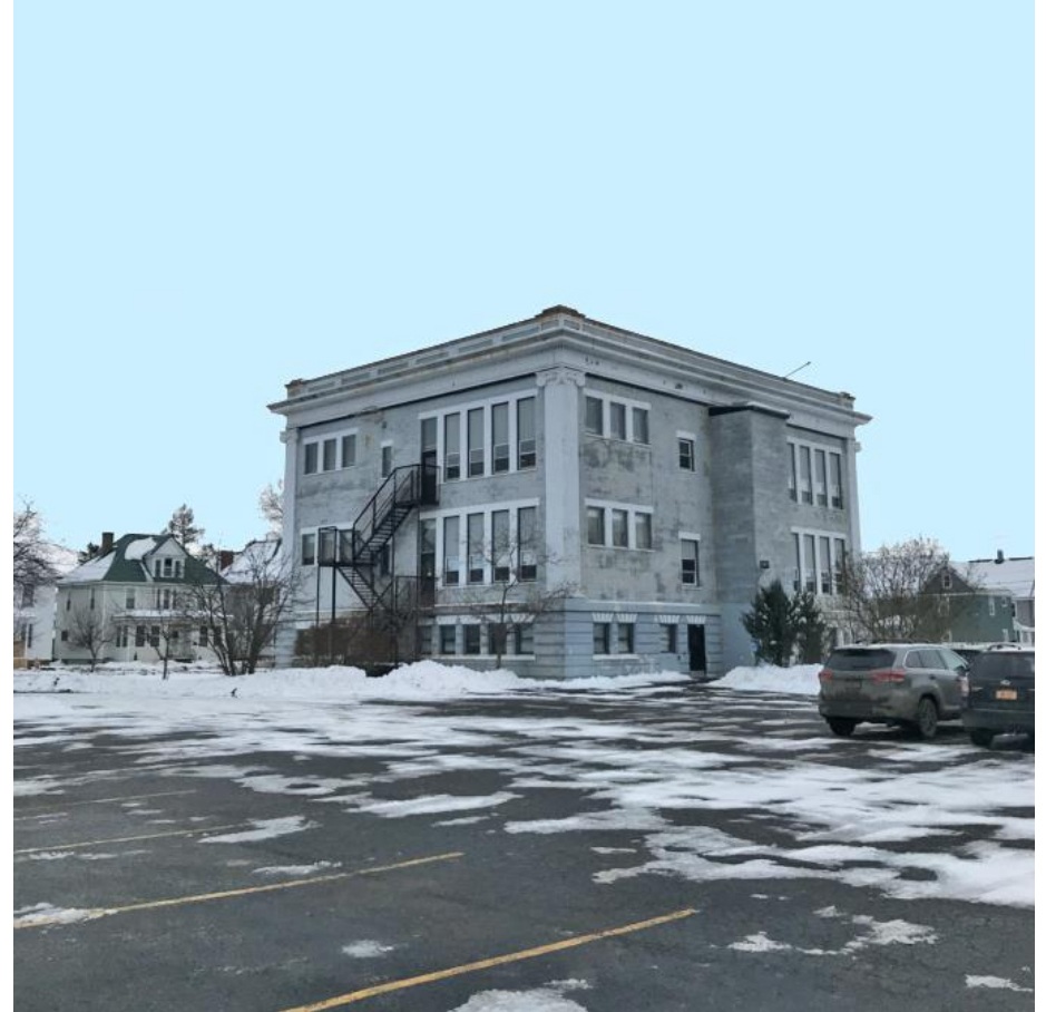
Rear View of Building and Parking Lot