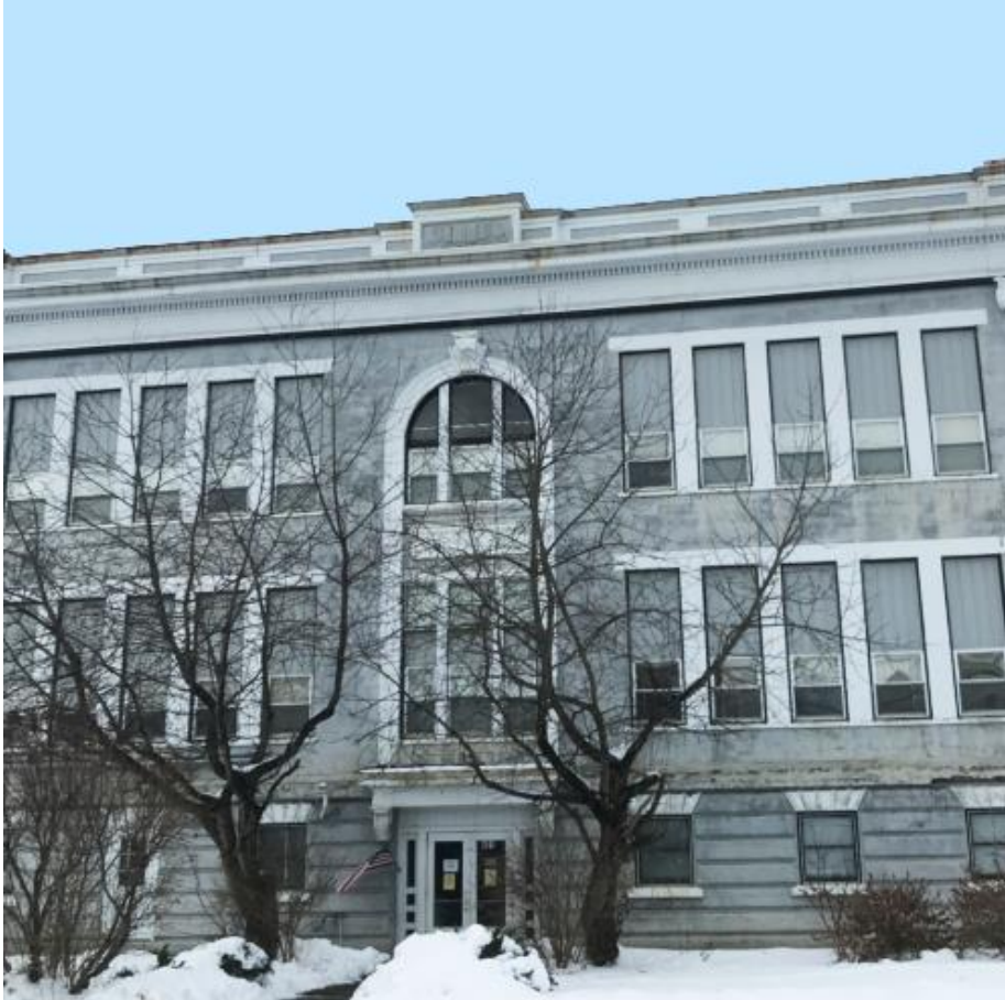
View of Front of Building