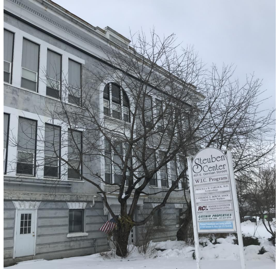
Visible Front of Building Signage