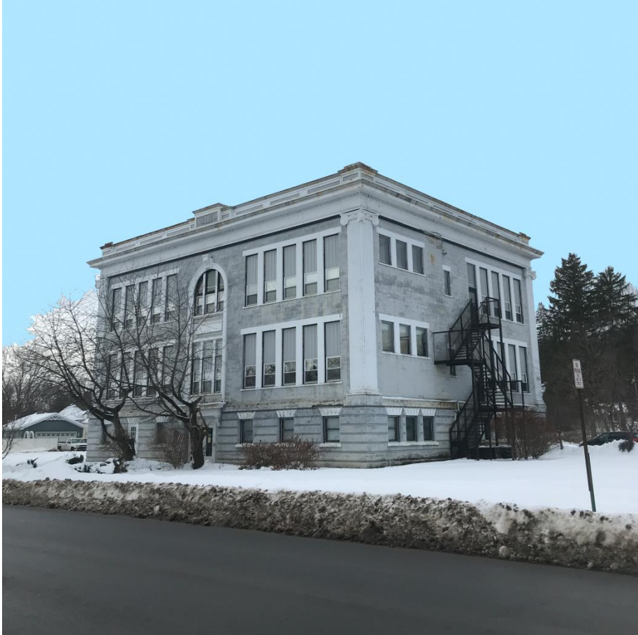
Side View of Building