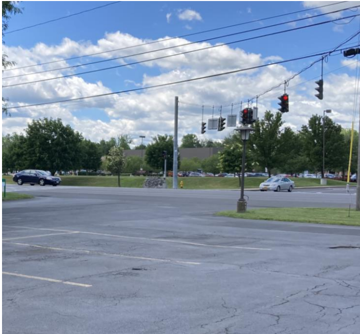
Dedicated Signaled Intersection at Route 57