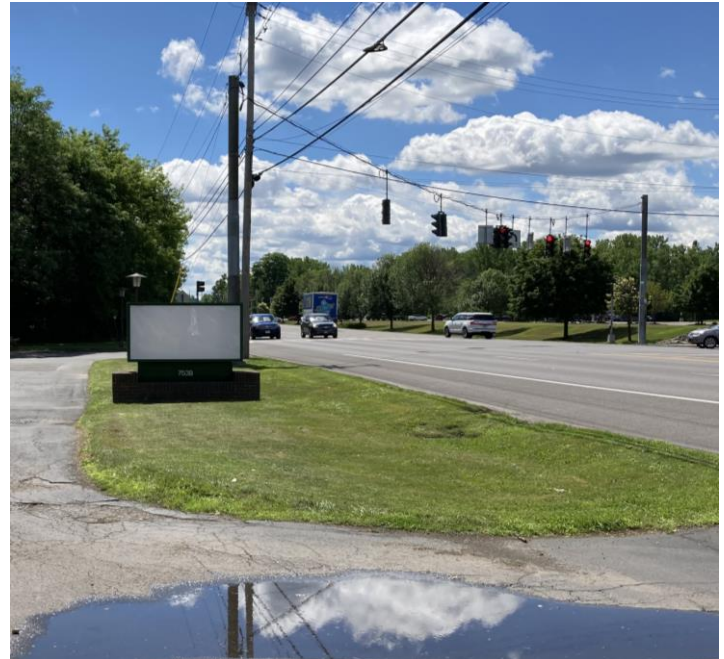
Monument Sign & Dedicated Signaled Intersection