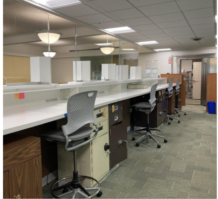
Behind Teller Area