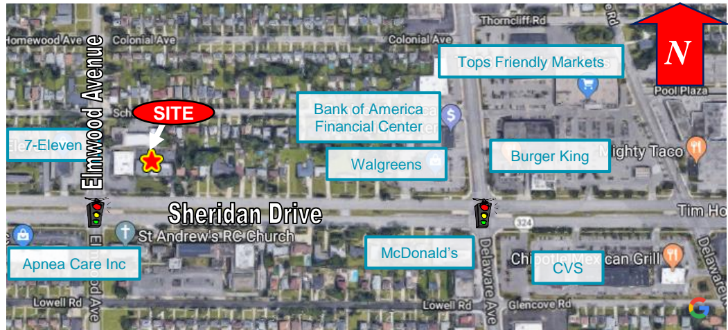
Site Plan / Aerial