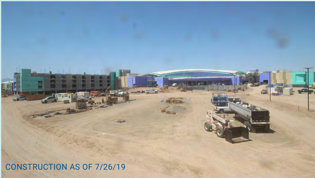
CONSTRUCTION AS OF 7/26/19