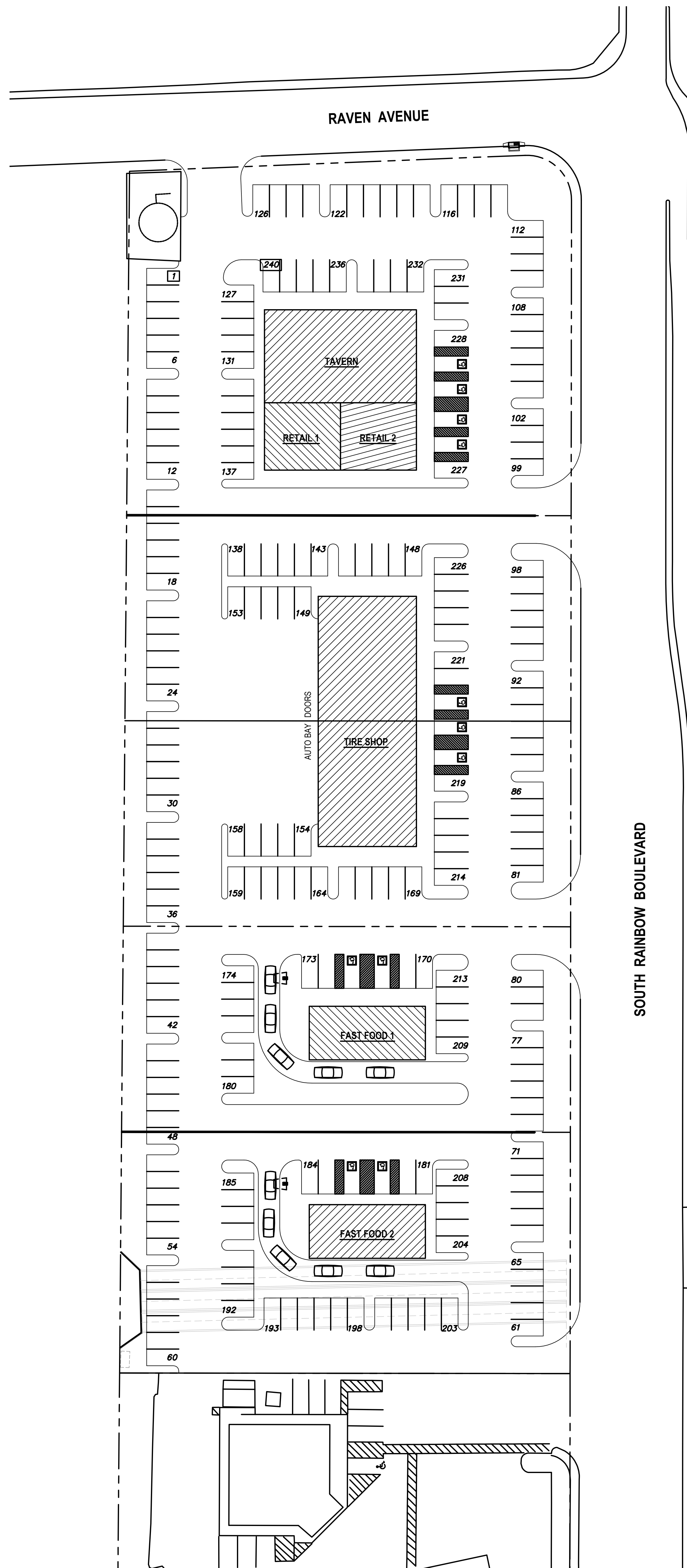
ENLARGED CONCEPTUAL SITE PLAN SCALE: 1/32" = 1'-0" 16