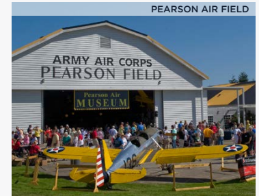
PEARSON AIR FIELD