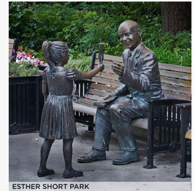
ESTHER SHORT PARK