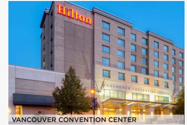
VANCOUVER CONVENTION CENTER