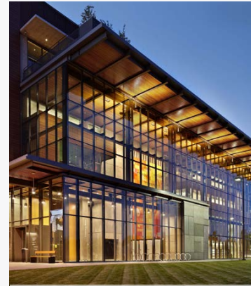
VANCOUVER, WASHINGTON CITY LIBRARY