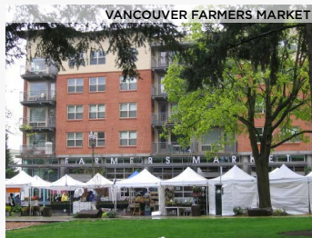
VANCOUVER FARMERS MARKET