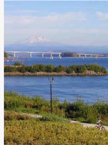
COLUMBIA RIVER RENAISSANCE TRAIL