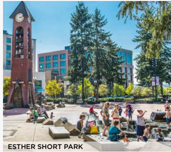
ESTHER SHORT PARK

In 1997, the city of Vancouver decided to dedicate the next 15–20 years to redeveloping and revitalizing the downtown core, west of I-5 and south of Evergreen Boulevard. The first projects started in the early 2000s with the construction of many tall condominium structures around Esther Short park.