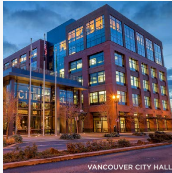
VANCOUVER CITY HALL