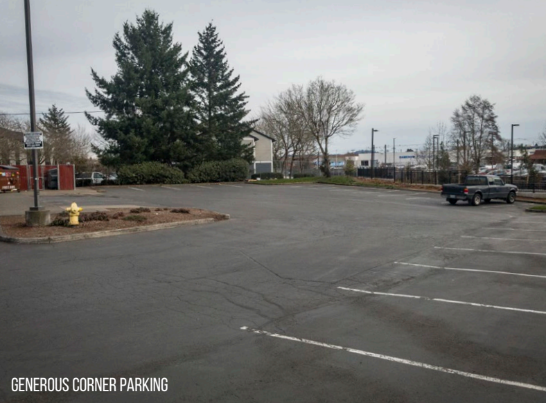
GENEROUS CORNER PARKING