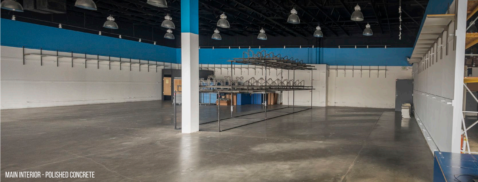
MAIN INTERIOR - POLISHED CONCRETE