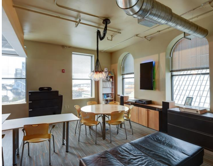
Space as an Experience