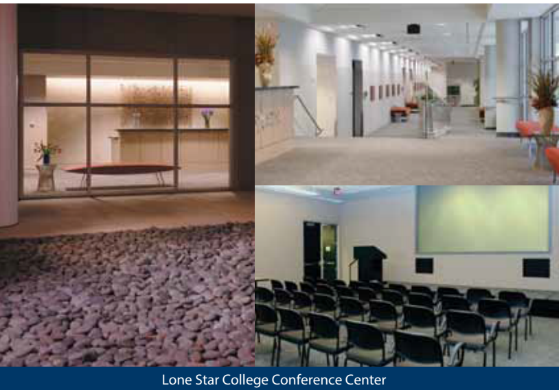
Lone Star College Conference Center