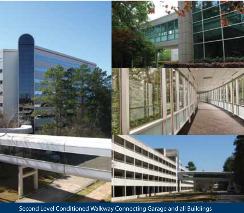
Second Level Conditioned Walkway Connecting Garage and all Buildings