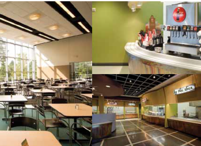
Spacious Dining Facility and Luby's Food Court